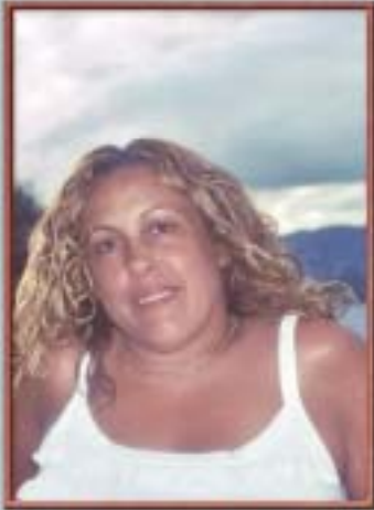
Before (170 lbs.)