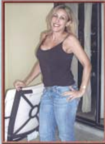
After (120 lbs.)